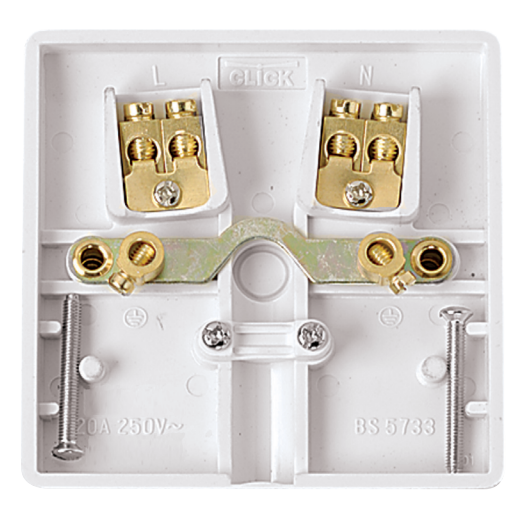
CCA017 - Rear View